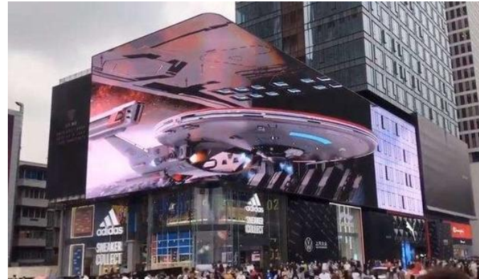
Powerful Marketing Tool