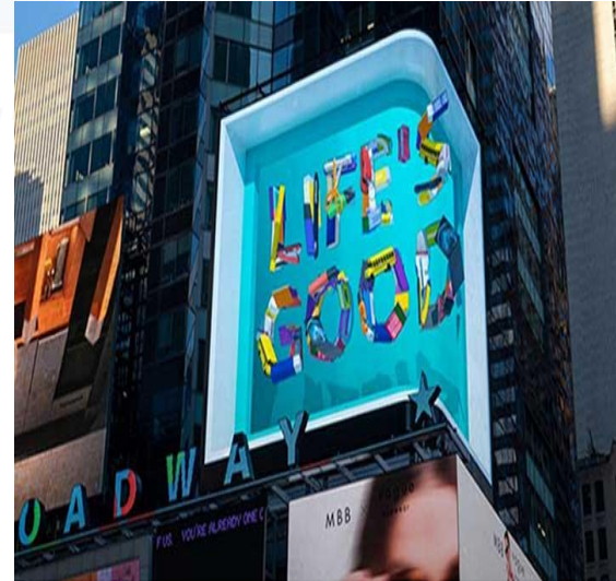
Extraordinary Image Quality