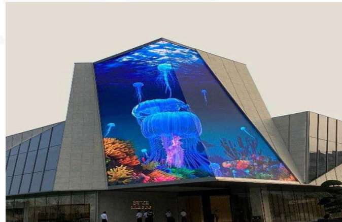
Enhance Brand Image