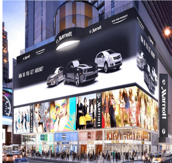
Maximize Product Exposure