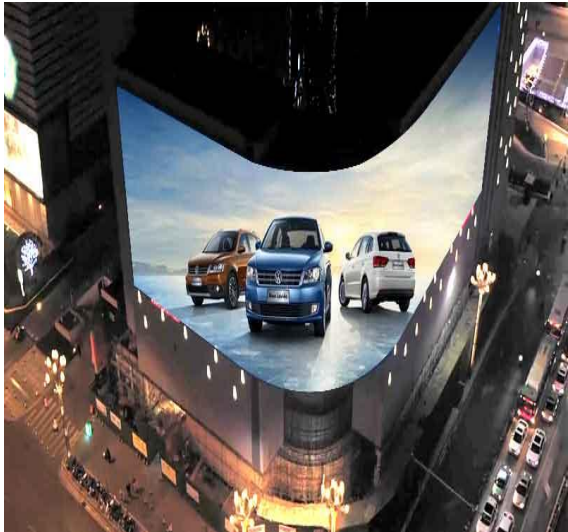
Marketing Without Location Restrictions