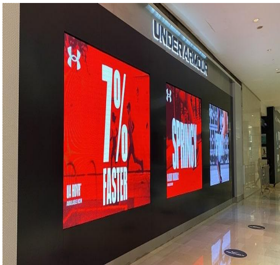
Display Discount Info.