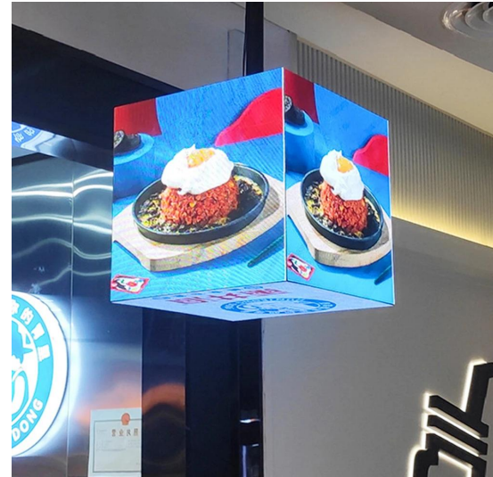
For Retail Stores