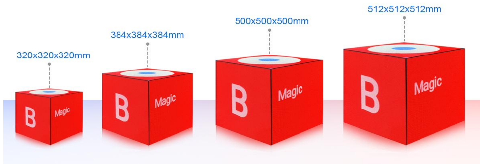
Multiple customizable sizes