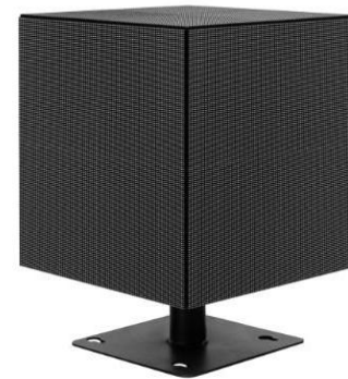
4-6 display sides optional