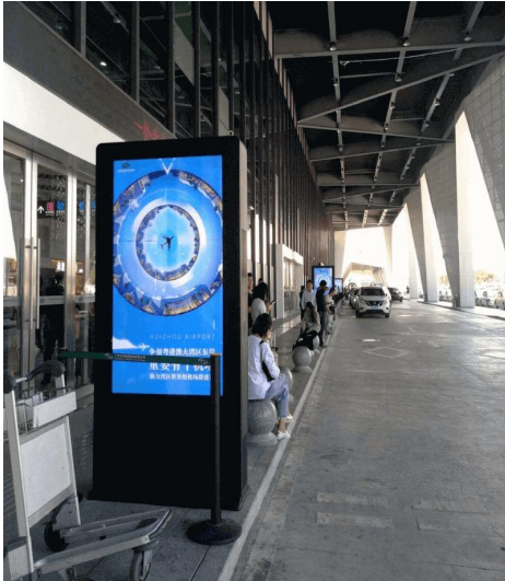
AirPort Information Display