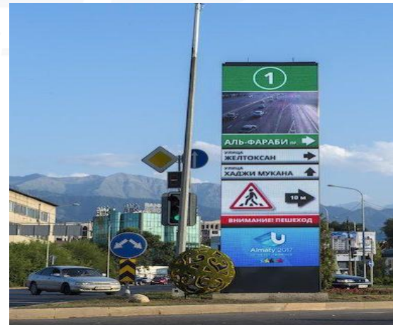
Direct traffic on the highway